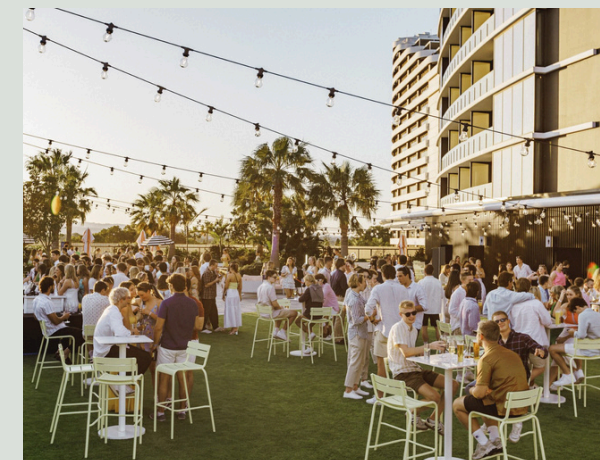
Sunset Social (11.11)