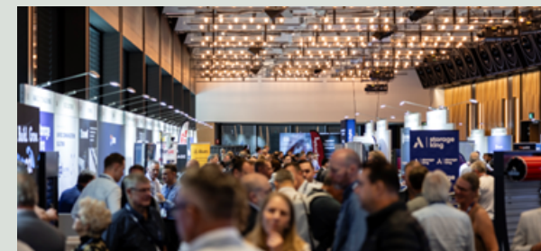
Trade Show (11.11 & 12.11)